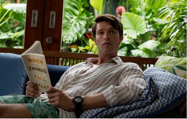
Patrick Schwarzenegger plays Saxon Ratliff, their self-assured eldest son, adjusting (or not) to the privileged expectations placed upon him. Leslie Bibb and Michelle Monaghan are part of a trio of longtime friends reuniting for a “girls’ trip” that veers into emotional territory neither expected.